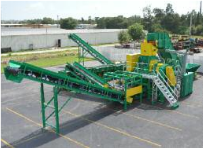
New CM Zero Waste System featuring a CM4R Liberator with a clean wire separation system.

CM has just completed a Zero Waste Tire Recycling System for Niramax, a two location landfill and solid waste RDF processor located in Hartlepool in the UK.