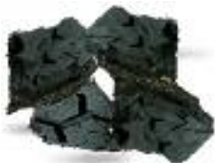
Chips & Shreds From Shredder