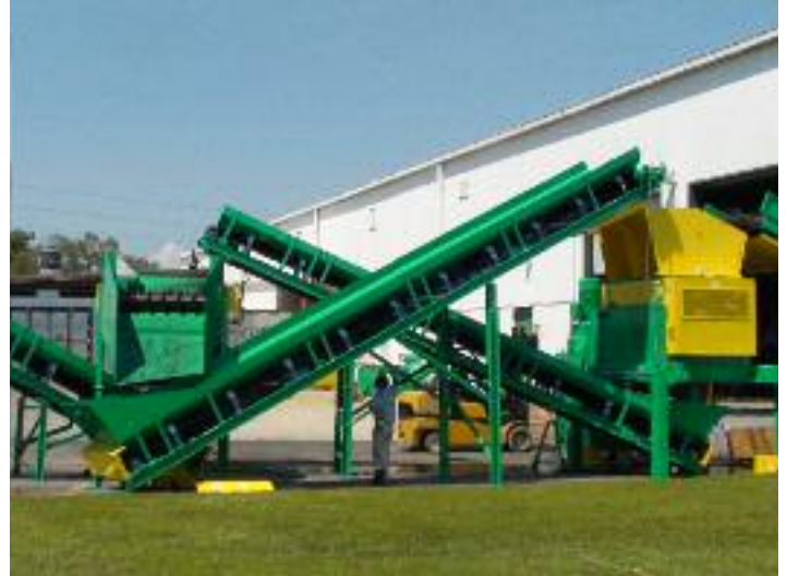
The CM Primary Tire Shredder and External Classification System on site at CM for final testing before being packed up and transported to Toronto, Ontario.

used for athletic surfaces for improved traction and injury reduction.