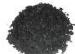
<1% Steel Content

Reclaim contaminated steel and rubber reject from existing TDF, mulch or crumb rubber processing systems CM systems include: CM2R or 4R Liberators, Magnetic Separators and Wire Screen Systems