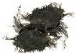
Rejected TDF With High Steel Content