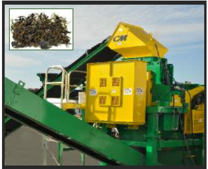
The CM 2R Liberator the smaller but just as rugged steel removal system. Designed to eliminate comingled rubber and steel waste for maximum profit.

The installation of the CM2R Liberator combined with a wire screen separation system has eliminated the waste. Empire is now recovering all of the steel from their process and providing wire free TDF for a local pulp and paper mill.