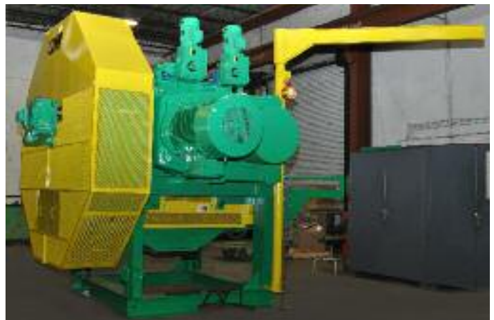
CM Single Speed Tire Shredder utilizing a dual drive system for processing passenger car tires.

CM Asia is awaiting the arrival of a CM Single Speed Tire Shredder for PERAK for their TDF operation in Kuala Lumpur. This system is outfitted with dual drive shaft mounted gearmotors specifically designed for processing whole passenger car tires.