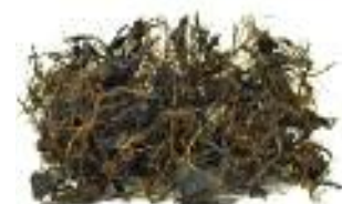
Comingled Rubber & Steel From Mulch/Crumb Rubber Production